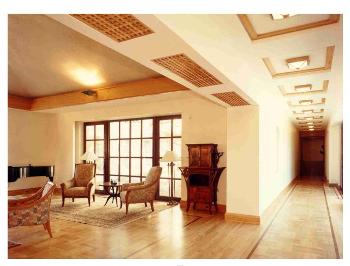
West Wing Sitting Room

The complex consists of 3 1/2 story main building, flanked by two one-story pavilions. The central building houses major public functions on the first level and bedroom suites on the upper floors. The east pavilion contains a swimming pool, greenhouse and a spa room. The west pavilion contains a central octagonal two story library several sitting rooms and a sound studio. The lower levels of the building house a complete health club complex, including a basketball court, exercise and aerobics spaces, spa and locker facilities, children's play and rumpus room, media center and mechanical rooms.