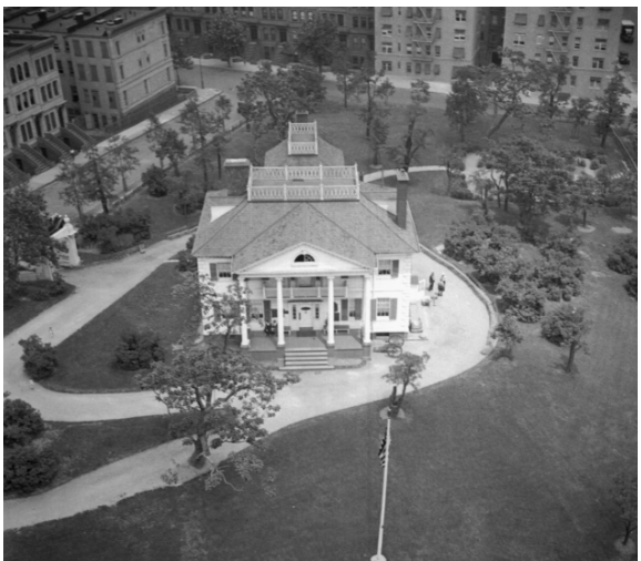
Morris Jumel Mansion

Manhattan's oldest surviving house, built about 1765 as a summer retreat. The mansion is located on a parcel known as "Mount Morris" from which the , Harlem River, the Bronx, Long Island Sound, New York City Hudson River and the Jersey Palisades are visible