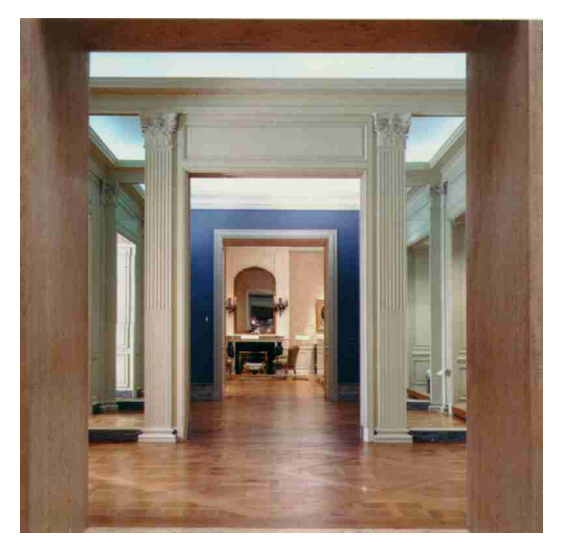
The Linsky Gallery