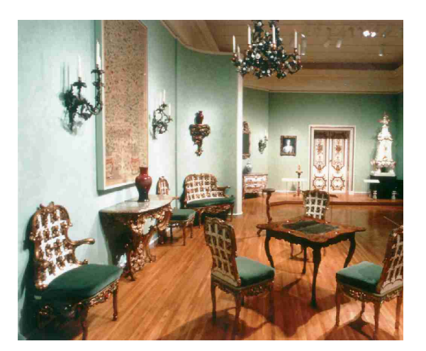
European Decorative Arts Gallery