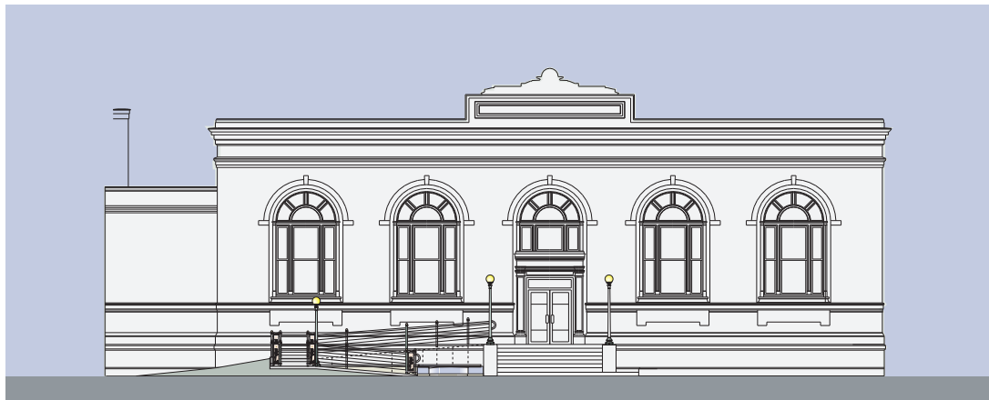
Elevation of Ramp to Eastern Parkway Branch

The Carnegie Libraries have been centers of community life since Andrew Carnegie built them for New York City at the turn of the century. Improving access for the physically challenged in a pleasant and functional manner is the mandate of our society and the goal for this rehabilitation. The design solutions give equal concern to the architectural quality of these landmark structures and preserve them as examples of New York's finest civic architecture.